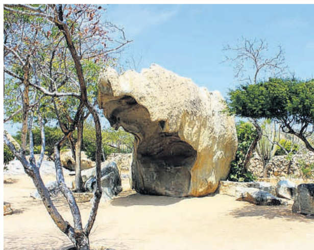
The Ayo Rock Formation

(Oranjestad)—The Ayo and Casibari Rock Formations are known locally as one of the crucial sites to have in your "off-road" trip itinerary. These naturally formed rock formations as just one of the few places on the island that hold a rich history of our culture and of our ancestors.